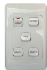
5 Gang Rocker Bakelite Wall Switch