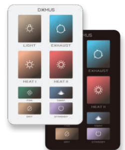
Coloured Vertical Switchplate Film Covers (Sold Separately)