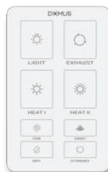
White Wall Controller (Included)