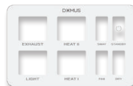
Horizontal Switchplate Film Cover (Included)